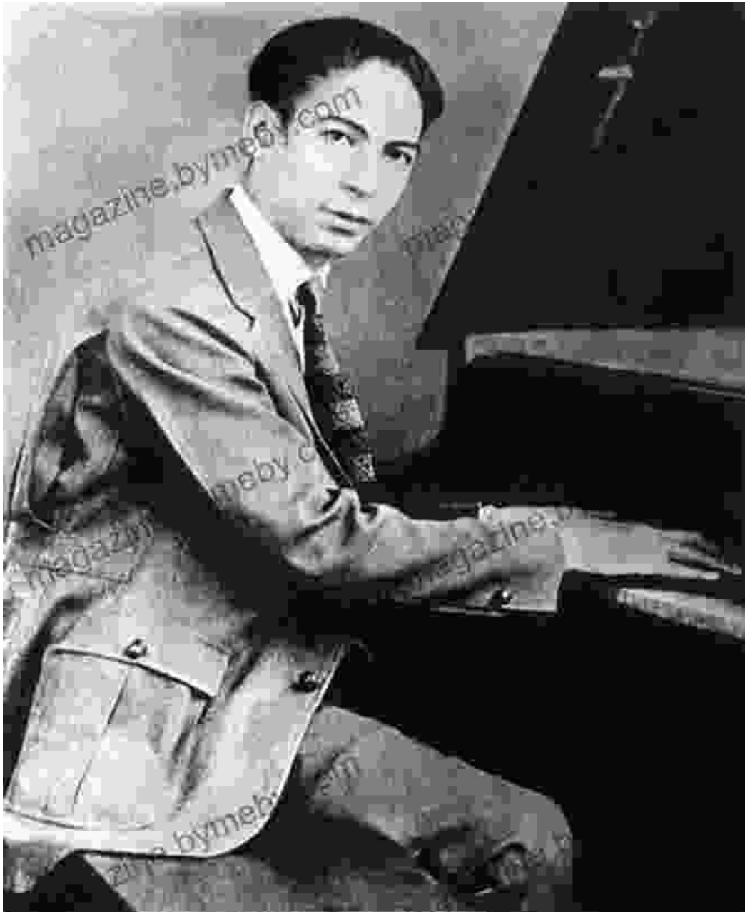
Jelly Roll Morton and the "Jelly Roll Morton Stomp"

Morton's Chicago recordings showcased his mastery of composition and improvisation. Tracks like "The Jelly Roll Blues" and "King Porter Stomp" became instant classics, demonstrating his ability to create complex and infectious melodies that pushed the boundaries of jazz.