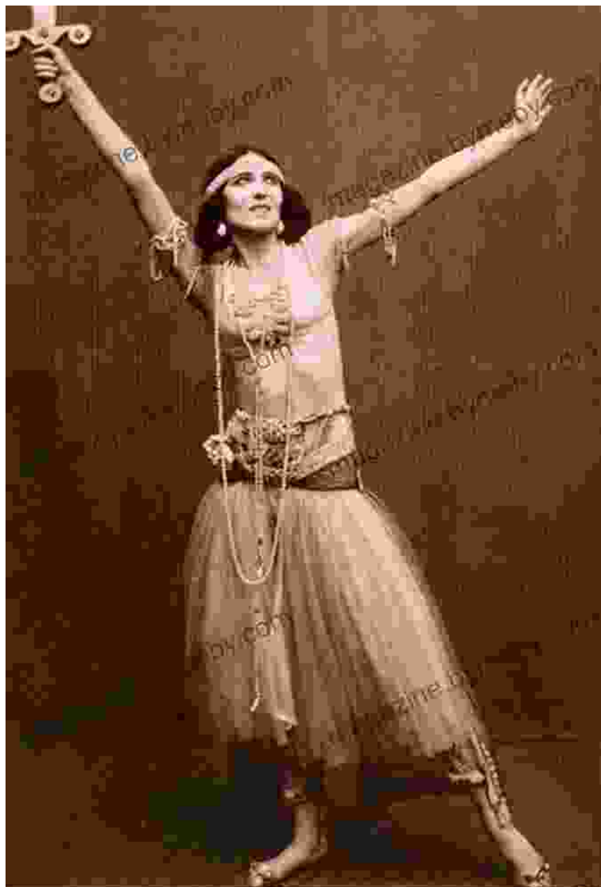
Ida Rubinstein in a scene from Scheherazade, embodying the enchantress with her expressive movements.

In 1909, Rubinstein joined Sergei Diaghilev's groundbreaking Ballets Russes company, which revolutionized the world of ballet. Diaghilev recognized Rubinstein's unique talent and cast her in prominent roles in productions such as "Cleopatra" and "Schéhérazade."