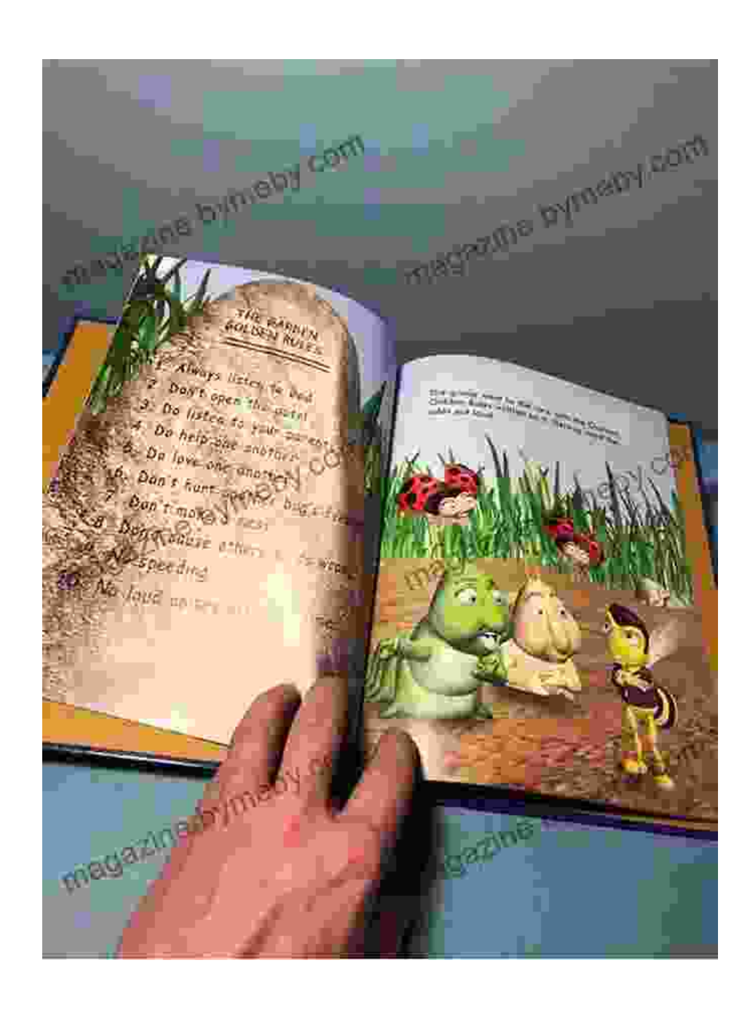
A Delightful Tale for Young Readers and Animal Lovers