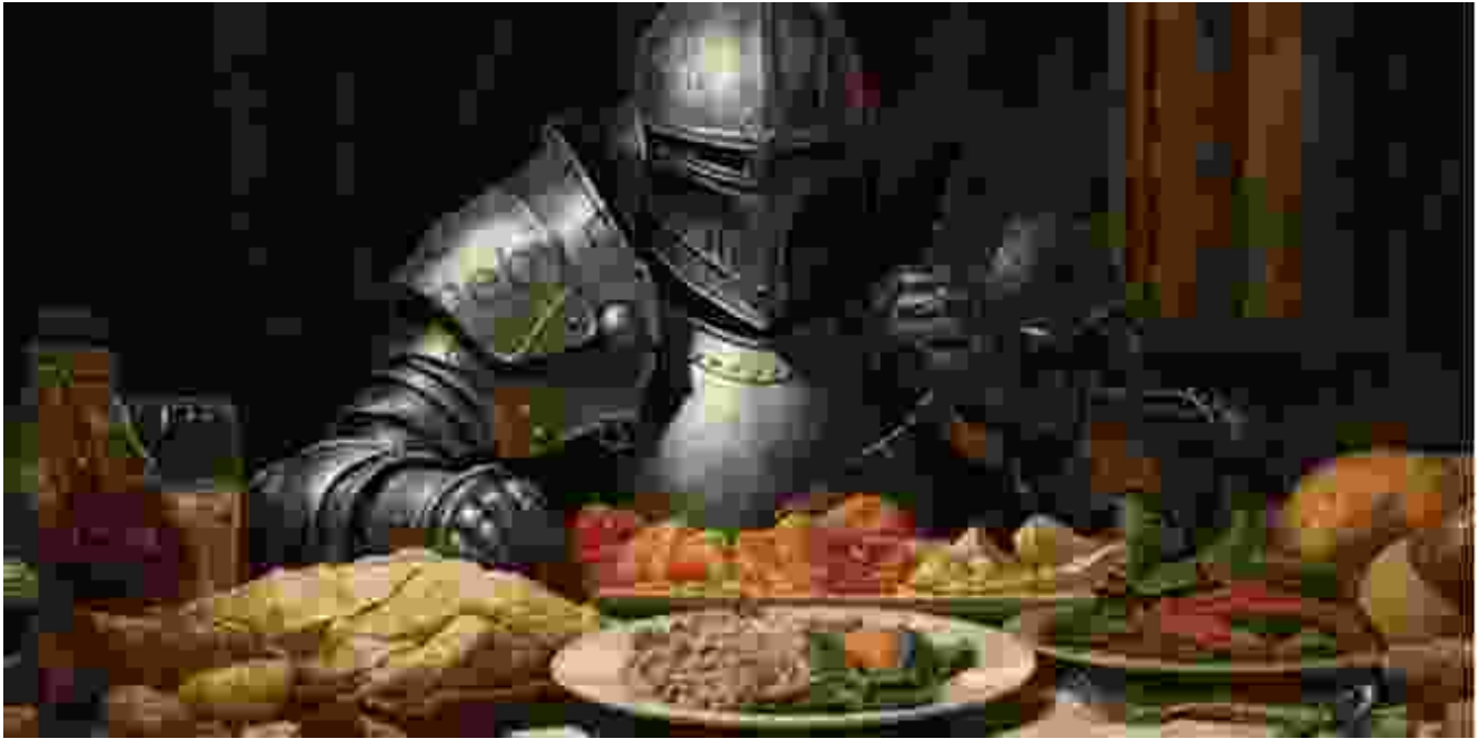
A knight eating a meal.