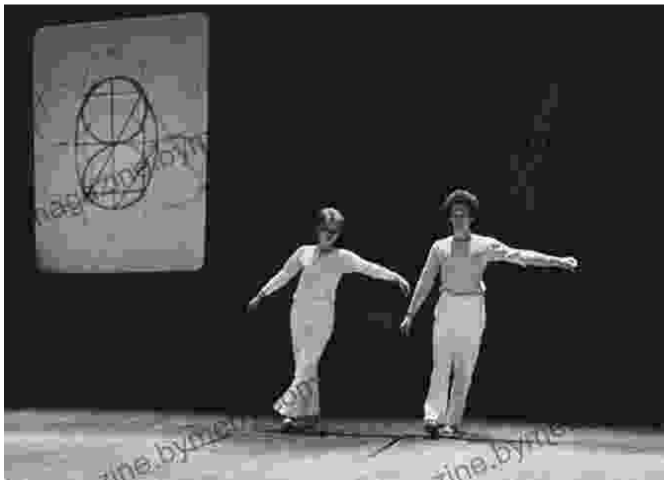
Simone Forti's drawing, c. 1960s

In addition to her dance and performance work, Forti also explored visual arts, particularly drawing and installation. Her drawings often depict the human body in motion, capturing the fluidity and energy of her dance performances. Forti also participated in the Fluxus movement, an international network of artists who emphasized playfulness, collaboration, and anti-establishment sentiment.