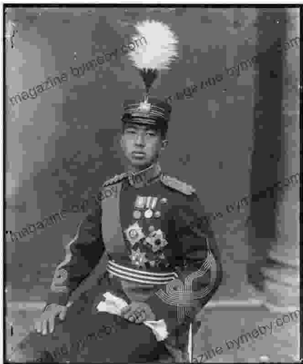
Emperor Hirohito as a young man

In 1921, Emperor Taisho passed away, and Hirohito ascended to the throne at the age of 20. His reign, known as the Showa period, would span over 60 years and would be one of the most tumultuous and transformative periods in Japanese history.